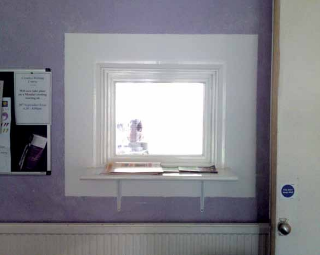
table. It has to be said here that this work has been achieved with the help and support from each member of the staff team that I work with.

Aside from the everyday challenges there is always an element of fun to be had here at Tressillian Road, whether it be a takeaway night and watching a DVD with the girls, having lengthy late night discussions on just about anything and everything, the occasional water fight in the garden on a hot day and shopping trips with a ressie. Our annual day trip this year was to Southend-on-Sea, where everyone had a great time, the weather wasn't great but didn't dampen anyone's spirits for enjoying themselves, and now looking forward to the House BBQ for the girls which we are hoping will take place over the August Bank Holiday, then it's the biggie, Christmas at MPMT which is always a fun time. Can't wait to see Santa again, but wow how he changes from year to year!